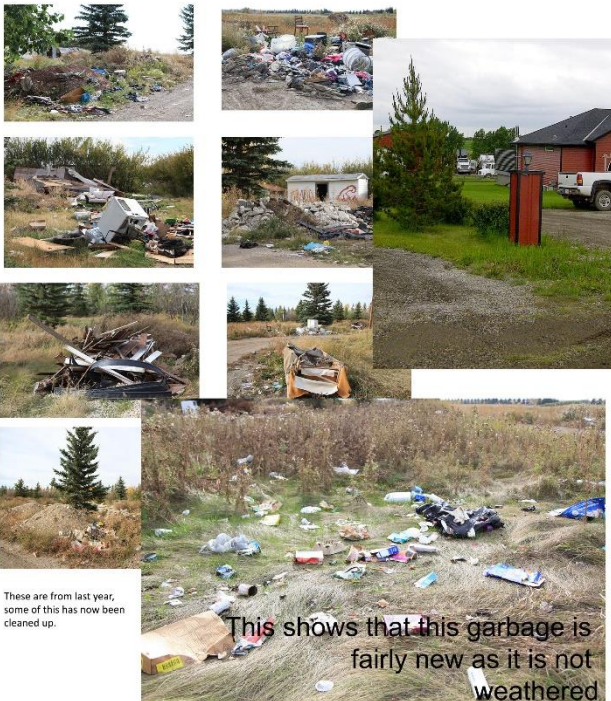
Garbage dumping in another lot