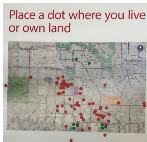
Figure 1.2 Open House Participant Location Map

Figure 1.2 (below) is a photo of the map board that was included at the open house. The board asked participants to indicate where they lived. This was voluntary, so the image below reflects those who chose to participate. Note, that green and red stickies identify where participants indicated they lived.