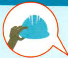
Venues and facilities