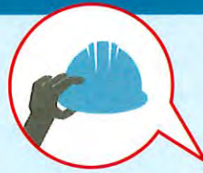
Venues and facilities