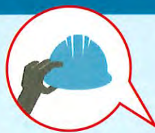
Venues and facilities