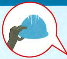
Venues and facilities