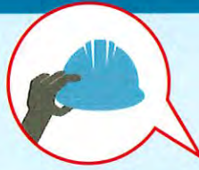
Venues and facilities