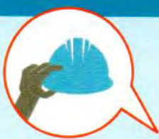
Venues and facilities