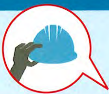
Venues and facilities