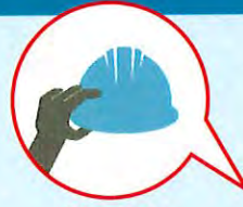
Venues and facilities