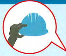
Venues and facilities