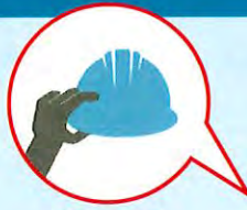
Venues and facilities