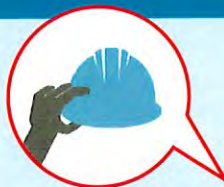
Venues and facilities