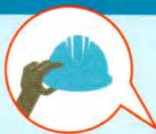
Venues and facilities