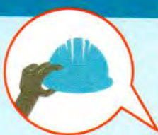
Venues and facilities