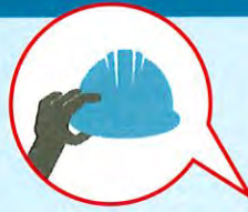
Venues and facilities