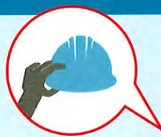
Venues and facilities