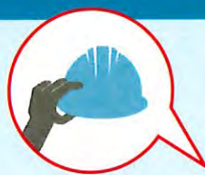
Venues and facilities