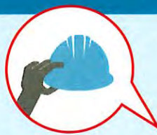
Venues and facilities