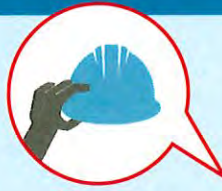
Venues and facilities