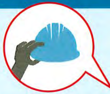
Venues and facilities