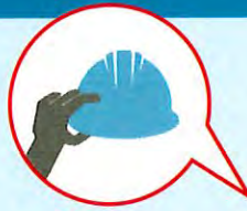
Venues and facilities