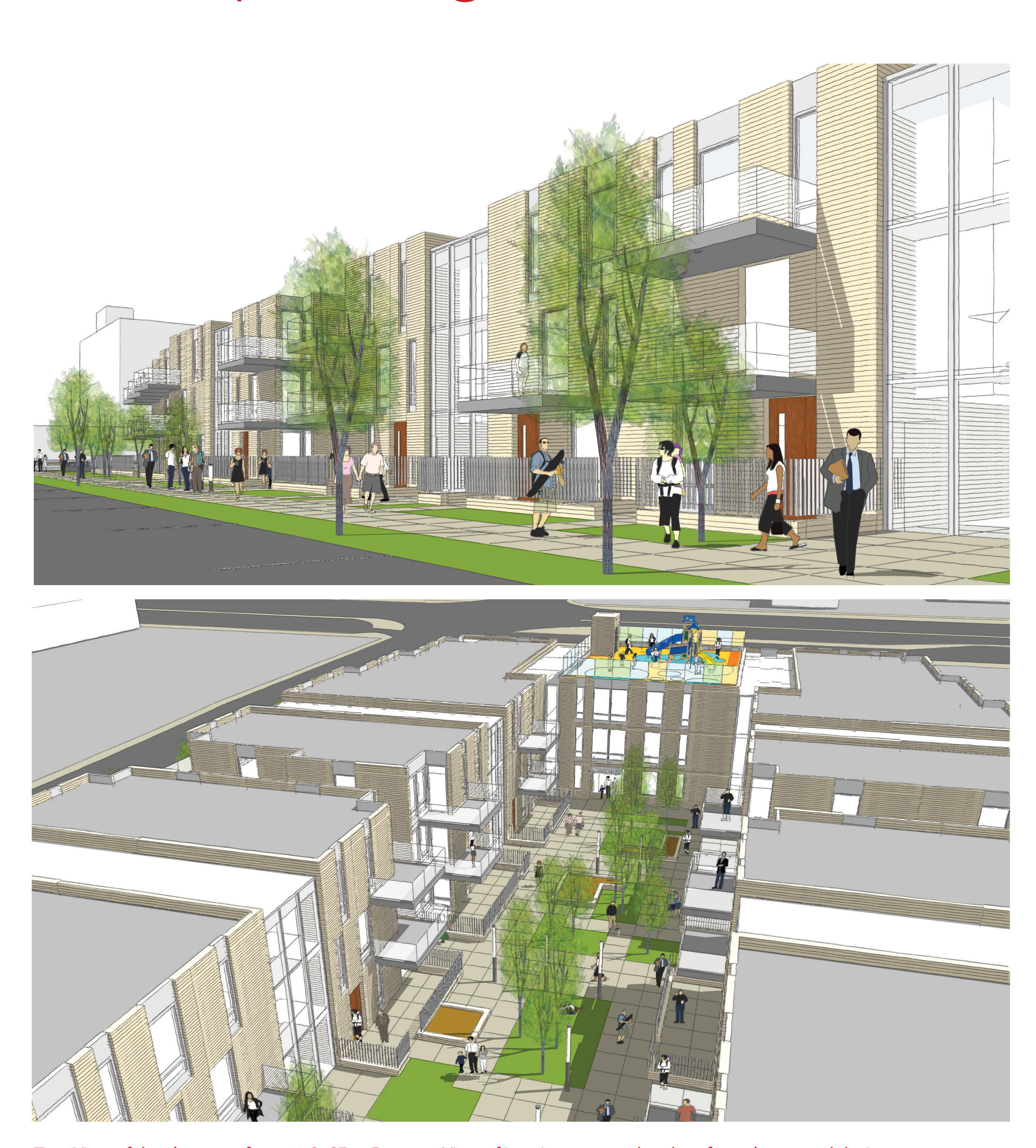
Top: View of development from 33 St SE Bottom: View of interior courtyard and rooftop playground design.

The concept design for the Southview affordable housing site is based on existing zoning, which allows for 3 to 4 storeys and 196 dwelling units.