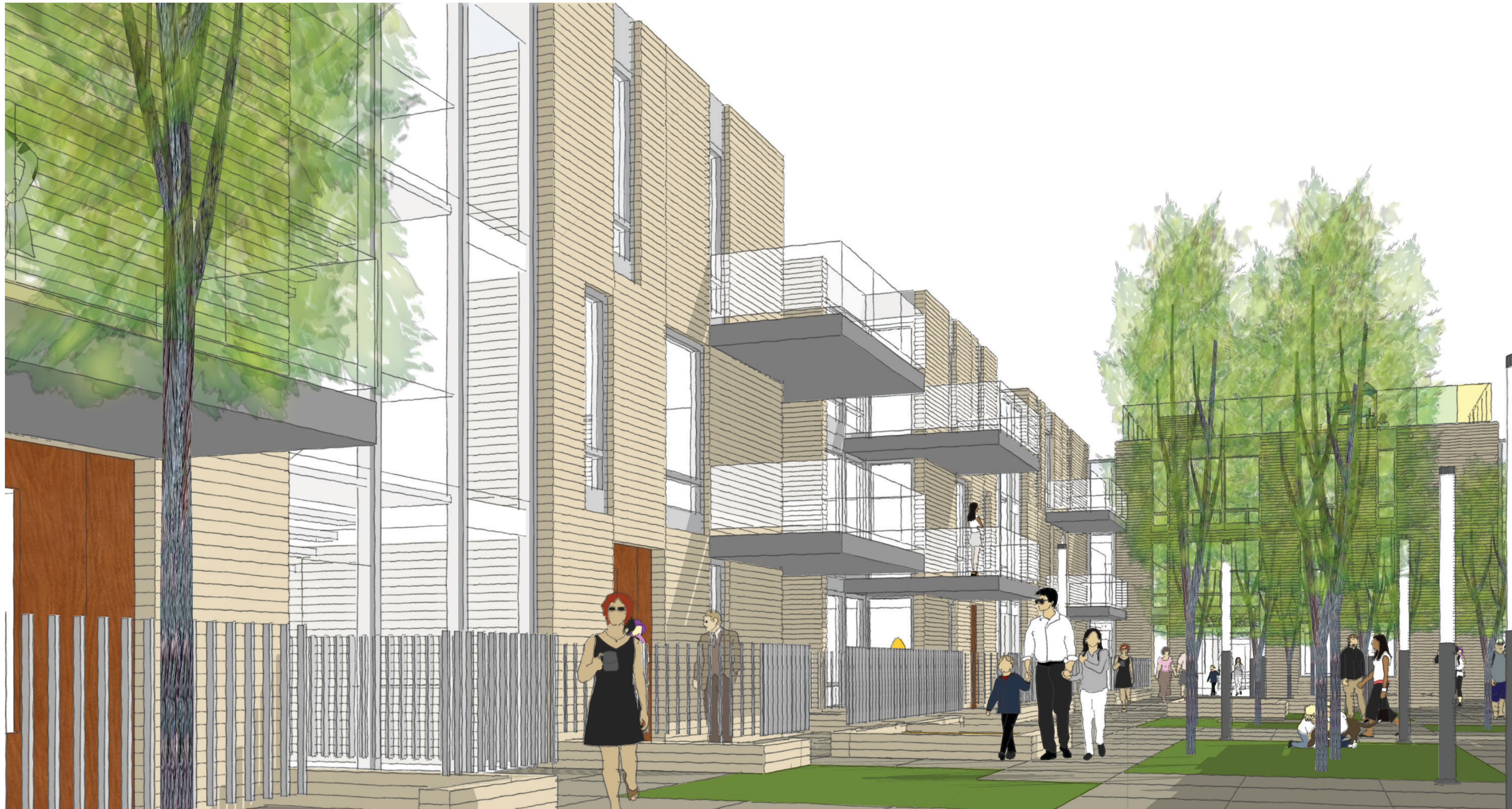
Top: Aerial view of the concept, from the northwest Bottom: View of interior courtyard design.