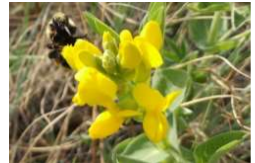
Columbine flower: J.Weiler, Wildlife photos: Tony LePrieur