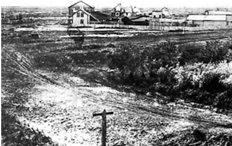
Macleod Trail S, Calgary, Alberta.

Like the CPR branch, Macleod Trail S predated the annexation and the development of the Heritage Communities. Both were developed in a context completely different from their present surroundings. Macleod Trail S evolved from the Old North Trail to function as a colonial supply route, and it eventually became Provincial Highway #2 south from Calgary before Deerfoot Trail replaced it. It follows a section line, which made it a natural dividing point for property ownership during the plan area's agricultural period and, subsequently, when farmers sold their lands for subdivision development. The CPR tracks had a more complicated effect on subdivision development. The historic right-of-way cut through farms, and it similarly cut through later subdivisions developed on those agricultural properties. Developers incorporated the tracks into their plans, using the tracks as a dividing point between residential and commercial/industrial areas.