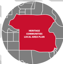
Figure 1: Plan Context

The implementation of the vision is dependent on several factors, including but not limited to population growth, economic considerations, development trends and infrastructure improvements. The Plan is meant to be updated periodically as growth and change occur.