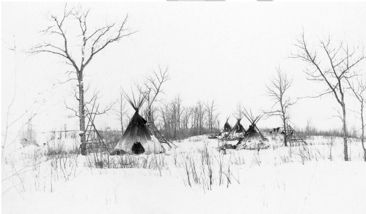
"First Nations camp on the Elbow River, Calgary, Alberta", ca. 1886–88 (CU185314)

The plan area is intersected by a portion of what was the Old North Trail, a north-south transportation route established and used by Indigenous peoples. Physical evidence of Indigenous life in the plan area has been disturbed, mostly through agricultural use and subdivision development, which preceded the passage of the Alberta Historical Resources Act in 1972. Archaeological work before and after that date have identified 23 archaeological sites, mostly in the margins of the two river valleys, and there is potential for further discoveries.